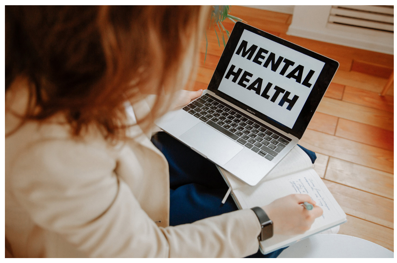
37 | Mitchell Community College | Community Resource Guide

Issues: Anxiety, Bipolar Disorder, Borderline Personality, Chronic Impulsivity, Coping Skills, Depression, Divorce, Emotional Disturbance, Grief, Infertility, Infidelity, Life Coaching, Life Transitions, Marital and Premarital, Men's Issues, Narcissistic Personality, Obsessive-Compulsive (OCD), Parenting, Peer Relationships, Pregnancy, Prenatal, Postpartum, Self Esteem, Self-Harming, Sex Therapy, Sexual Abuse, Sexual Addiction, Stress, Suicidal Ideation, Transgender, Women's Issues