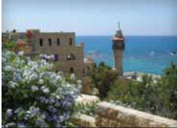
DAY 2: Old Jaffa