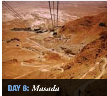
DAY 6: Masada