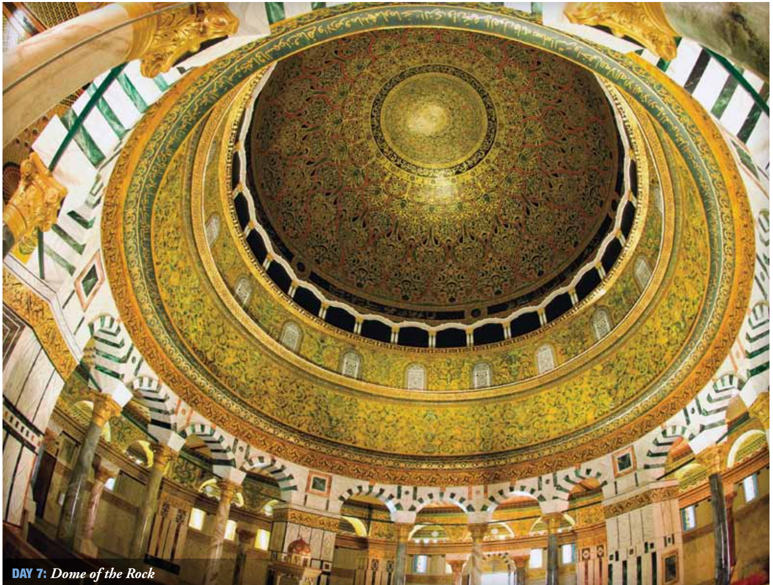
DAY 7: Dome of the Rock