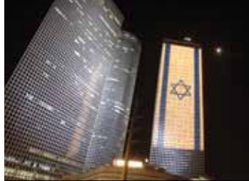
DAY 3: Tel Aviv