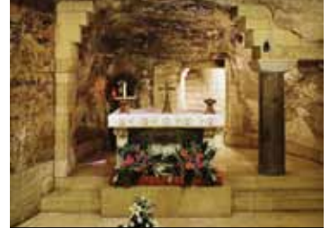
DAY 4: Mary's Well