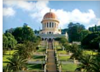
DAY 3: Bahá'í Gardens