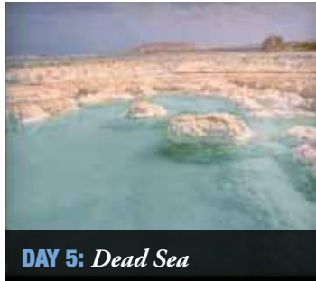
DAY 5: Dead Sea

Optional excursions let you incorporate additional sites and attractions into your itinerary and make the most of your time abroad.