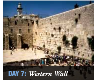
DAY 7: Western Wall