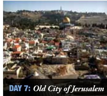
DAY 7: Old City of Jerusalem