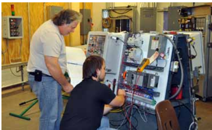
Advanced manufacturing lab provides hands-on training.

The Back-to-Work program is open to anyone who is unemployed or underemployed. Underemployment is defined as earning less than $22,980 per year for an individual or $47,100 for a family of four. The Spring 2014 Back-to-Work program does not require that participants be unemployed or underemployed for an extended period, a change from previous years.