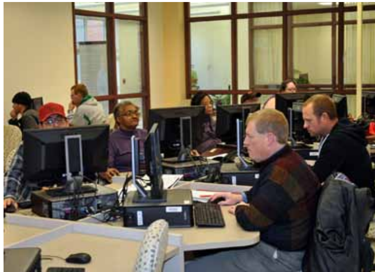
Students work in computer lab during Back-to-Work bootcamp.

Back-to-Work grant funds must be used by the end of June, so it is important to sign up for the program right away. The next Back-to-Work Boot Camp with orientation is scheduled for Jan. 6-10. During the week, participants will complete an orientation and a screening/advisement