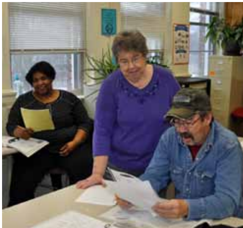
Our staff can help you choose the program that best fits your needs and time schedule. For more information, call (704) 878-3232.

With either program, students must take the Tests of Adult Basic Education (TABE®) assessment in reading and math. If your scores are low, you will be referred to an Adult Basic Skills class to brush up on your skills.