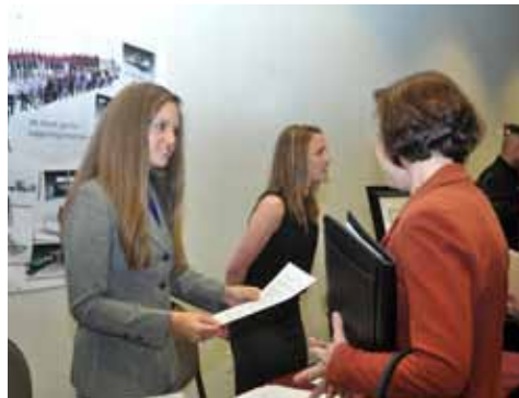
Representative from Onsrud shares information with one of the many job seekers.