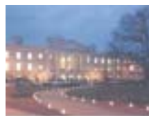
MITCHELL COMMUNITY COLLEGE COOKBOOK 2002